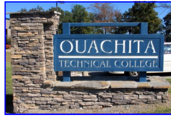
OTC front entrance signs