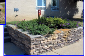
Administration building flower beds