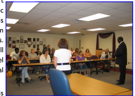
Session between students and HLC team