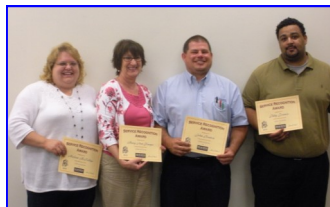
Five years of service

The Employee Recognition Breakfast is an annual event to recognize the dedicated employees of OTC with five or more years of service.