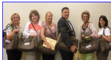
Fifteen years of service