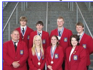
OTC Career Center SkillsUSA Team

It emphasizes total quality at work, high ethical standards, superior work skills, life-long education and pride in the dignity of work. SkillsUSA also promotes understanding of the free enterprise system and involvement in community service activities. Three of the seven college State officers who presided at the opening and closing ceremonies were from Ouachita