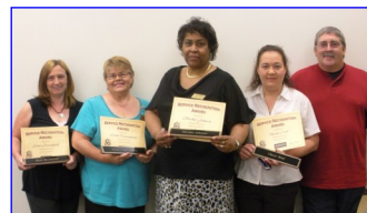
Ten years of service