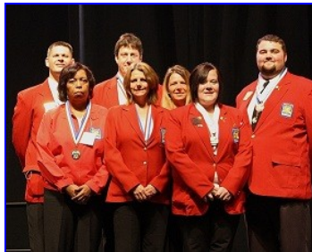
OTC College SkillsUSA Team

Students of Ouachita Technical College and Ouachita Area High School Career Center, a career and technical center sponsored by the college, represented our community well in the recent