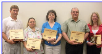
Twenty years of service