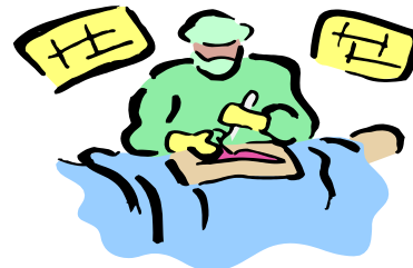
Medical Profession Education