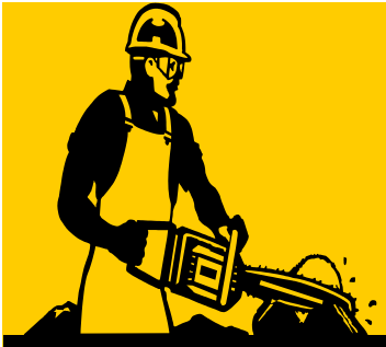
Power Equipment Technology